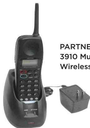
PARTNER 3910 MultiLine Wireless Phone

Down the hall or out in the warehouse? Grab a PARTNER wireless phone and roam far and wide with the confidence you'll be there for customers and colleagues alike. Make faster decisions. Delight your customers. Build your business.